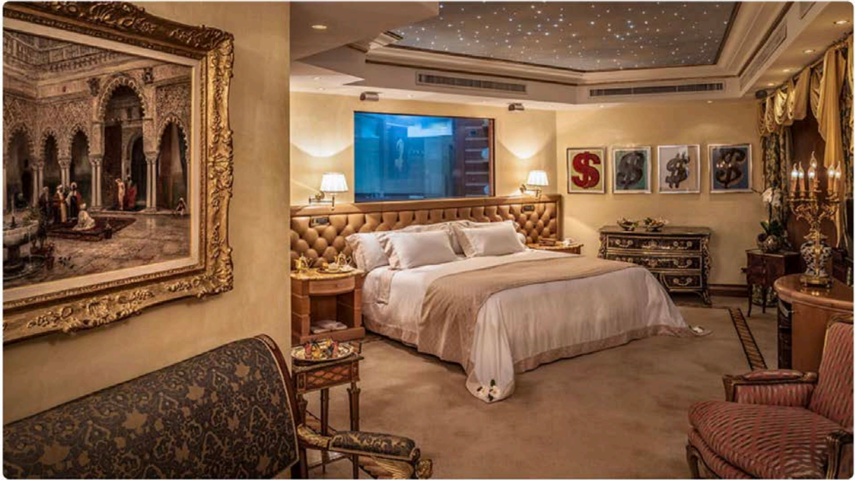
Rome Cavalieri, Penthouse Suite Bedroom with Andy Warhol. Waldorf Astoria Hotels & Resorts is part of Hilton Worldwide