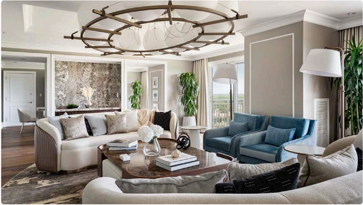
Royal Suite Living.