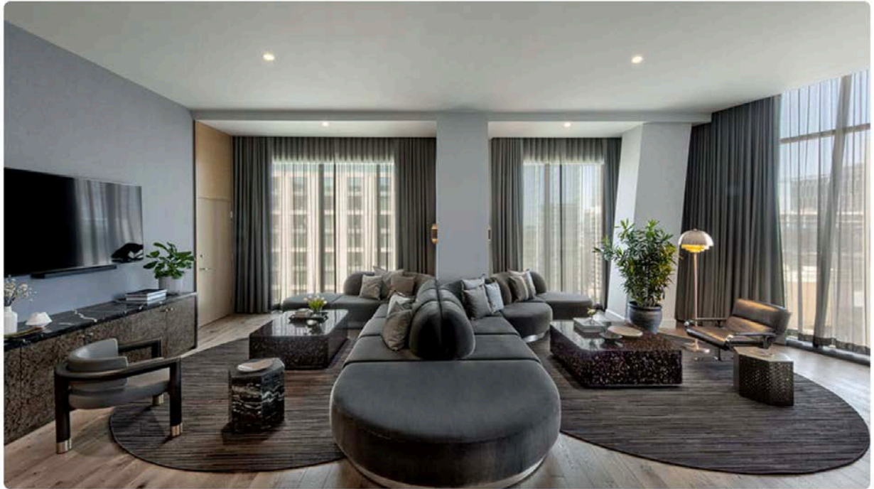
The Luxury Collection is part of Marriott.

The Royal Suite has plenty of space for families with children or multi-generational gatherings, including an airy living room, media room, and dining room. From the Royal Suite's eight personal balconies, guests have views of the surrounding lakes and championship golf course. There's an oversized master bathroom, as well as a state-of-the-art kitchen. Although Orlando has more than its share of fun experiences to offer, guests might just want to stay in and enjoy this luxurious suite.