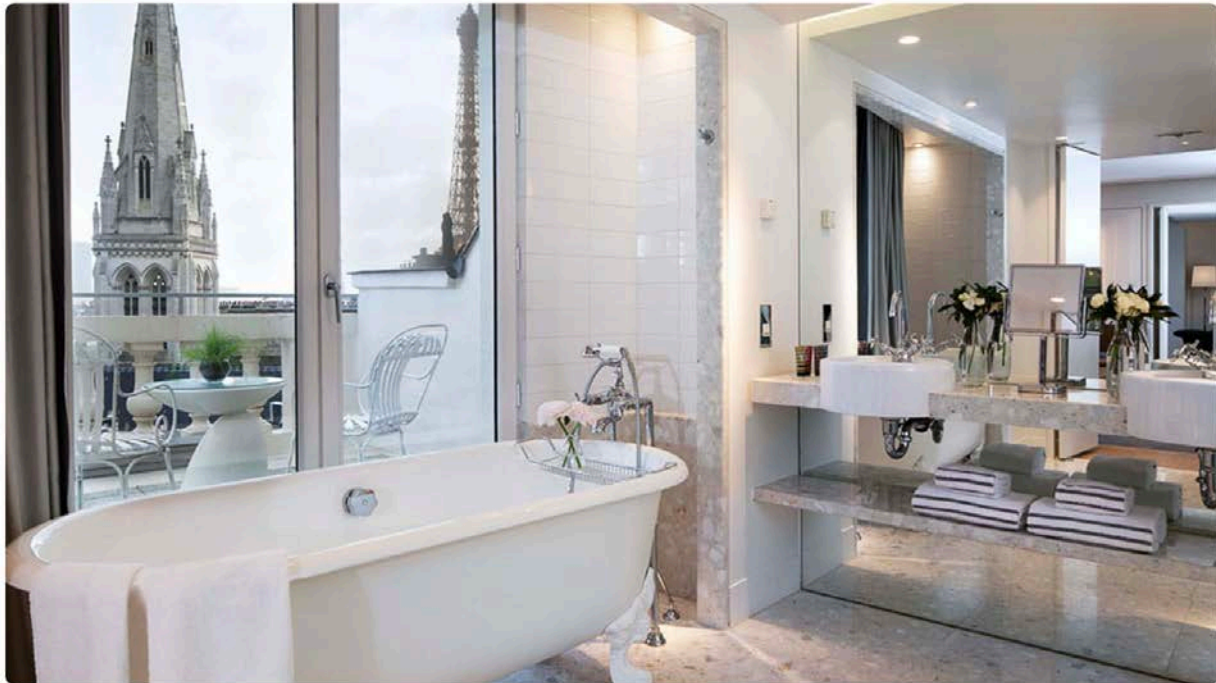
Suite Eiffel bathroom.

At the Seabird Resort in Oceanside, California, everything is centered on the sea. This classic California resort in Northern San Diego is located right on the beach. Guests staying in the Estate Suite have expansive views of the Pacific Ocean. The 1,241-square-foot suite has two bedrooms, two bathrooms, a large living room, and a reading nook. One of its most popular features is the expansive furnished patio. It's an excellent luxury suite for families.