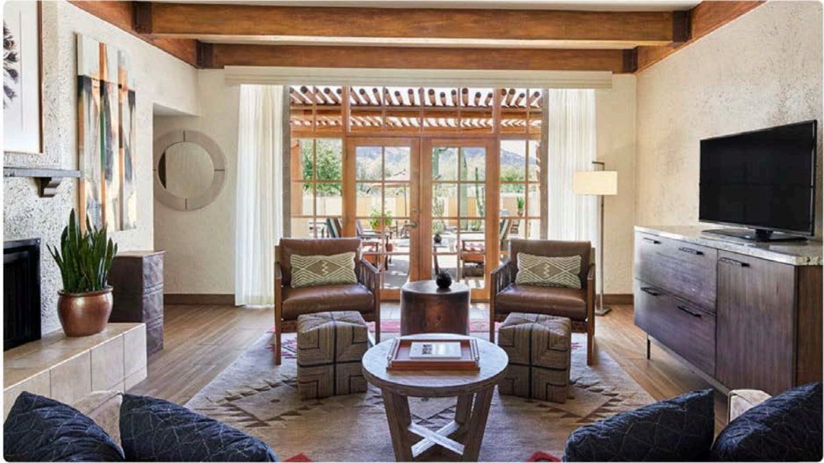
JW Marriott Scottsdale Camelback Inn Resort Spa.